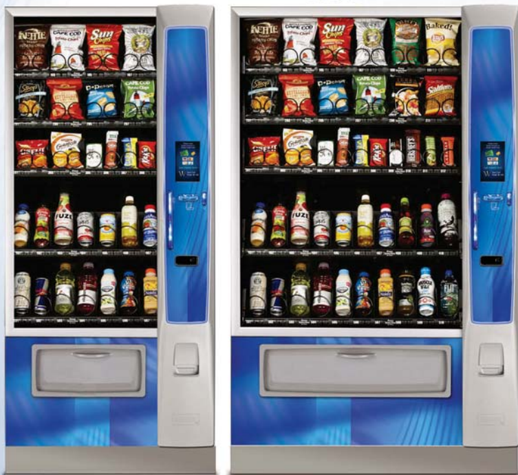
MERCHANT COMBO MEDIA 471 32 Select, 302 Capacity