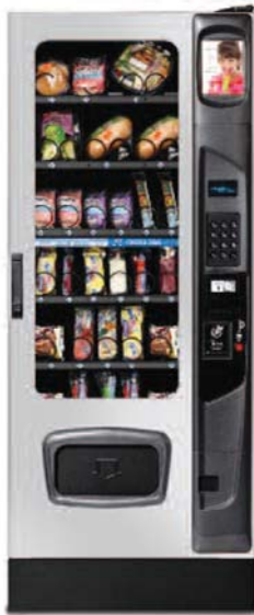
Shown with silver ADA door and kick panel options.