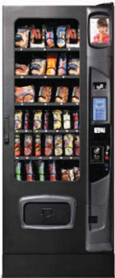
Shown in black with ADA door, iCart touch screen, automatic delivery assist and kick panel options.